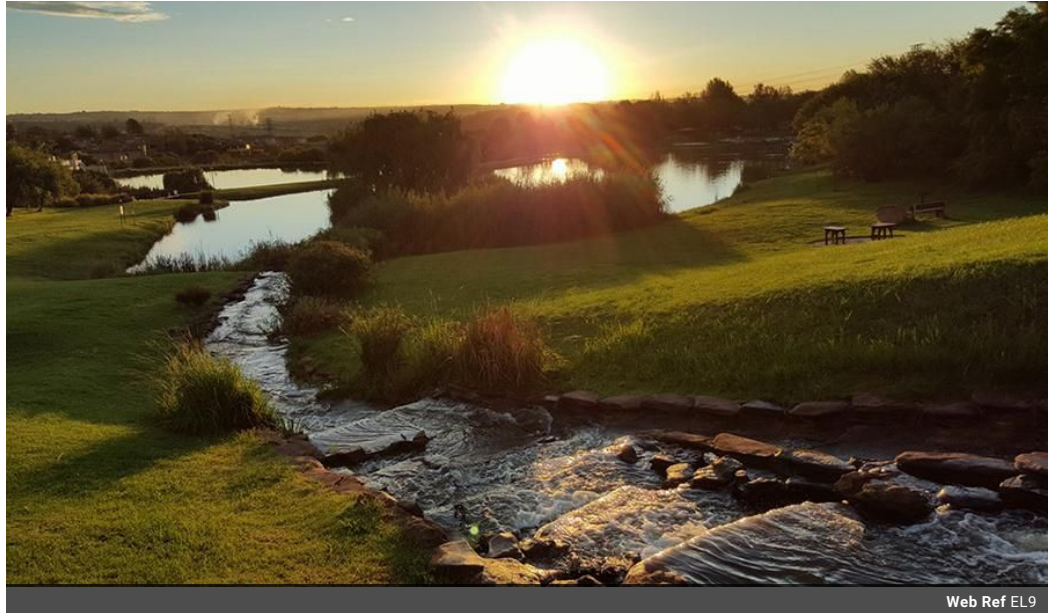
Web Ref EL9

Unit 1 Cyrus House (Building 13) Mulberry Hill Office Park, Dainfern, Sandton, 2191